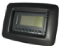
Pic.: black external cover (optional)

Main functions: switching the unit on and off - room temperature adjustment - manual or automatic heating/cooling selection with neutral zone - manual or automatic 3 speed setting - display for reading/displaying room and set point temperature - on-off valve control